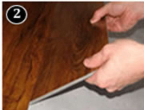
2 Angle the second plank and align the interlocking strips