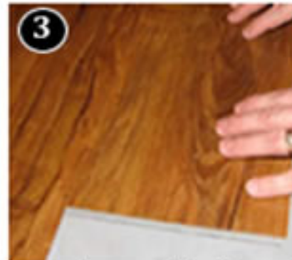
3 Press down and lock into place

at ALLURE LOCKING. Our vinyl flooring is made from the best materials and is designed to be a beautiful addition to your home. We are pleased to present you the best for ALLURE LOCKING.