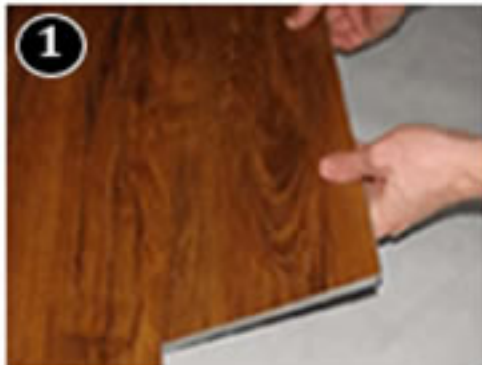
1 Position the 2 planks

at ALLURE LOCKING. Our vinyl flooring is made from the best materials and is designed to be a beautiful addition to your home.